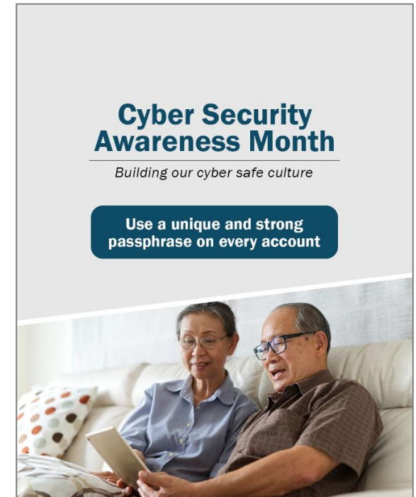
Social post – space for department logo

Links to additional resources and information on cyber.gov.au are also available on the webpage. These provide further advice and tips on software updates, passphrases and multi-factor authentication.